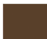
EC 169 Chocolate Brown