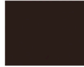
EC 156 Brown