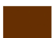
EC 182 Rust Brown