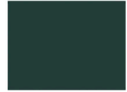
EC 160 dark green/blue